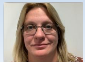
Solent Infant School (left to right)