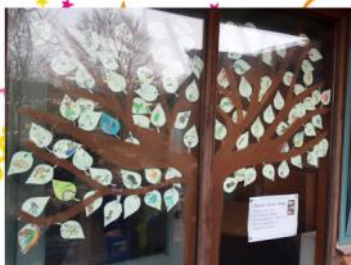
Our Reading Tree.

Did you know that all of our classes (except Year 6) have a buddy class? Year R are paired with Year 3, Year 1 with Year 4 and Year 2 with Year 5. When Year 2 come to transition over to the junior school, their buddies in Year 5 support them. They will have been buddied with this year group