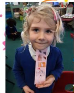
The children loved making bookmarks!