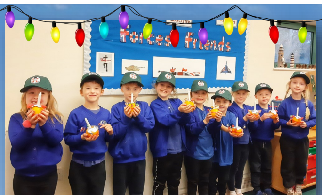
Forces Friends enjoyed learning about the meaning of Christingles and making them. These kits were Generously donated by 'Aggies'.

The FSS have launched a new event the 'Solent Twinkle Trail'. Thank you to all those of you that have already entered. We are still looking for more entries and would like to encourage all of our families to enter their houses. Your decorations may not feel like they are all singing and dancing, but that doesn't matter! The aim being, to provide a fun, healthy activity for the pupils of our school, whilst raising valuable funds to spend within our schools. You could also win a £50 voucher! So, don't delay, enter your house today by clicking here ! Full details on the back page.